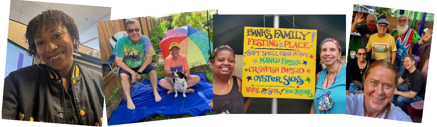
Our On-Air Festival of New Orleans Music and Culture made it possible for us to celebrate and groove together while remaining safely apart.